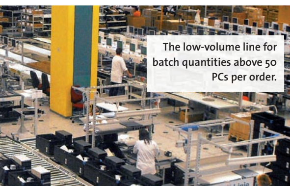
The low-volume line for batch quantities above 50 PCs per order.

Under those real-life conditions, the true